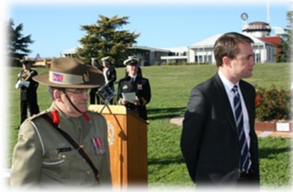
Mayors of Hobart & Launceston Below right