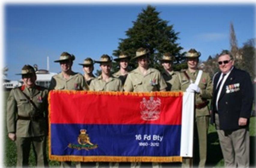
Presentation to RAA made at RFD to recognise 16 BTY as the last Tasmanian RAA unit in the lineage from 1860. Kings Park, Launceston – 7 July 2013