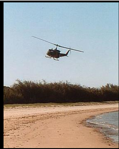
Tin Can Bay 2002

The 1972 photo looks like something out of M.A.S.H. while the colored photo was taken by holiday-makers who wandered too close to the area during another exercise in 2002.