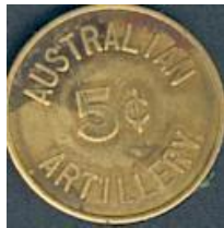
The Australian Artillery Five Cent token.

Historical Reference: http://www.anzacday.org.au/history/vietnam/longtan.html and http://www.maori2000.com/vcoy67/nuidat2.htm (Contain the Battle reports.)