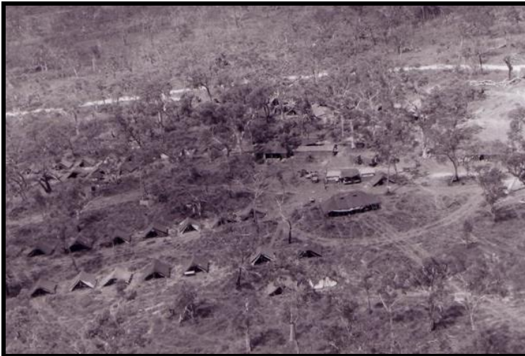
Tin Can Bay 1972

We have another where, why and when question that many of our members might know the answer to. This aerial shot is identified as being of a training area at Tin Can Bay, Queensland – but, for those of us who are ignorant of its military purpose at that time, the actual location and when in 1972 that this photo may have been taken, it would be great if someone could enlighten us.