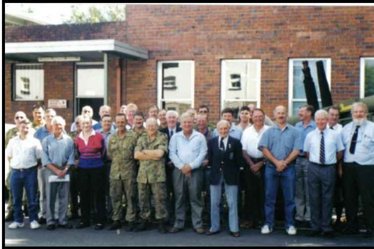
Some of those members present at the inaugural R.A.A. of Tas. Meeting.