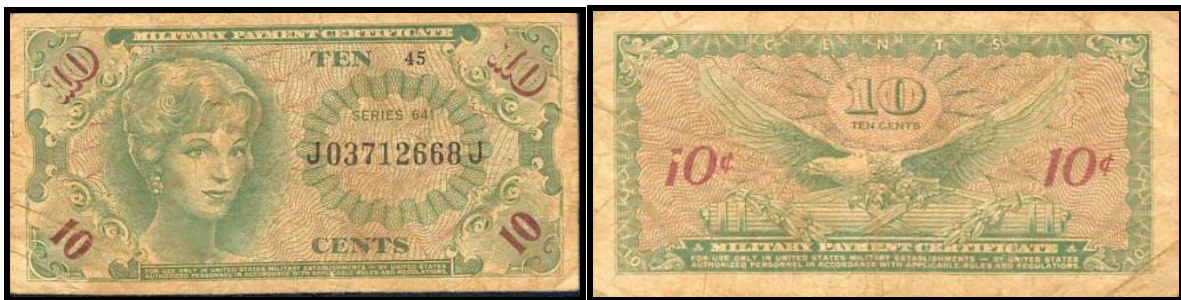
Sample U.S. Military Payment Certificate (Series # 641) issued between 31st August 1965 - 21st October 1968 - 10 Cents note