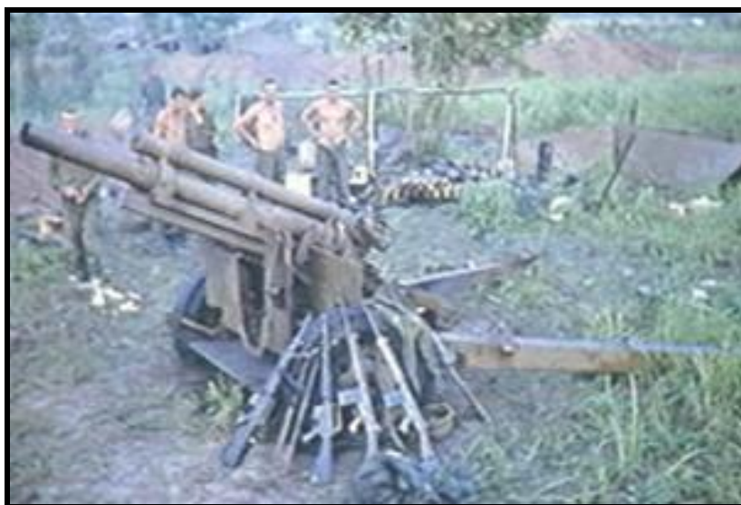
FSB Coral - Number 4 gun

Internet Access: http://www.diggerhistory.info/pages-battles/coral.htm